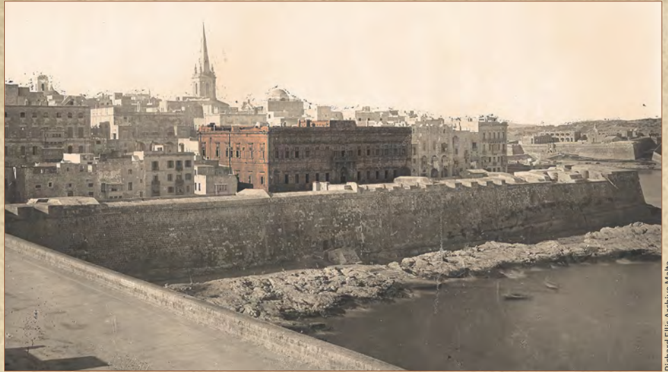
The former auberge of English and Bavarian knights became Bavière Hospital in 1915 and specialised in surgical cases of a very severe type, particularly head and spine injuries

♣ Continuing along the sea front, some 500 metres