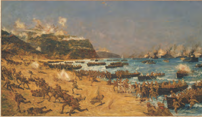
The landing at Anzac, 25 April, 1915, by Charles Dixon