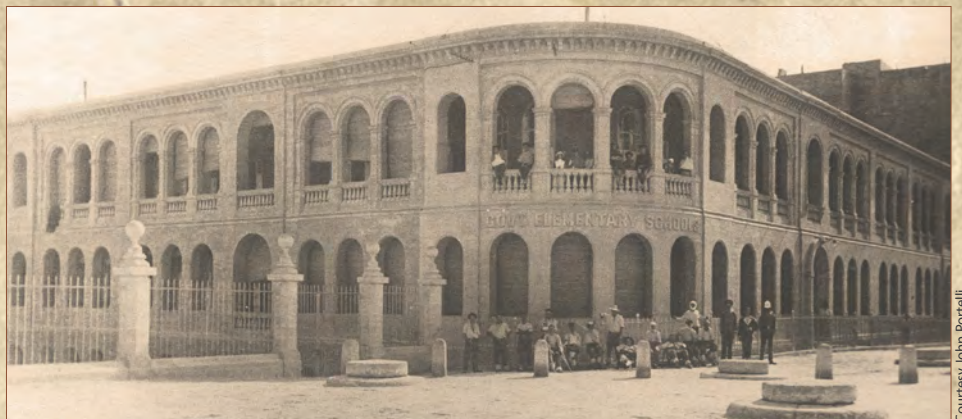
Recovering Anzacs ‘taking the air’ at St Elmo Hospital. It was here, in 1918, that a bullet was surgically removed from a trooper's heart - the first such operation in Malta

✧ Opposite the fort a government school was converted into the 218-bed St Elmo Hospital. Designated a surgical facility, it received its first patients on 12 August 1915, “but very soon more beds were needed and, by