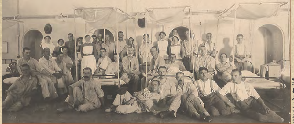
Recovering soldiers posing with nurses and ‘medicos’ at Valletta Hospital, that had “one of the biggest wards in the world”

available accommodation was taken up; each wounded was resting on his bed of comfort, where he was at once attended to by skilled medicos and devoted nurses.”