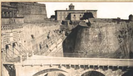
Valletta's original city gate (left) and the military gymnasium in the background — now site of the central bank

The tours also highlight points of interest on the islands – places where recovering servicemen and off duty personnel may have visited, and so can you.