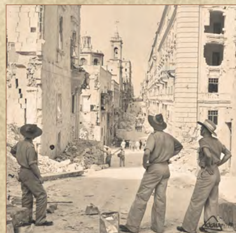
Australian servicemen in Valletta after an Axis air raid

† Make your way to Triq ir-Repubblika , retracing your steps past the Auberge de Castile , the statue of Grand Master de Valette and the renovated Pjazza Teatru Rjal – the original opera house was destroyed in 1942.