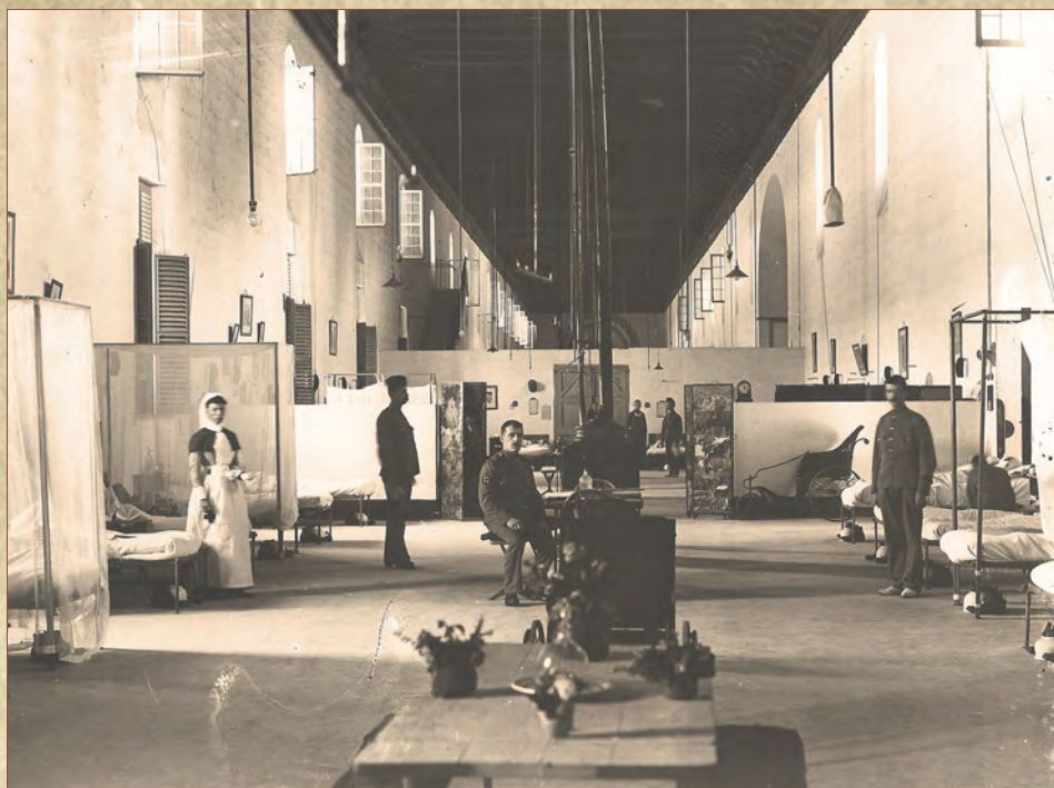
The Valletta Military Hospital, now the Mediterranean Conference Centre, was used expansively for triage and the treatment of the severely wounded

At the outbreak of the war Valletta Hospital had only 36 beds, but was increased to 440 just before the Gallipoli campaign with the renovation of disused wards and improvements made